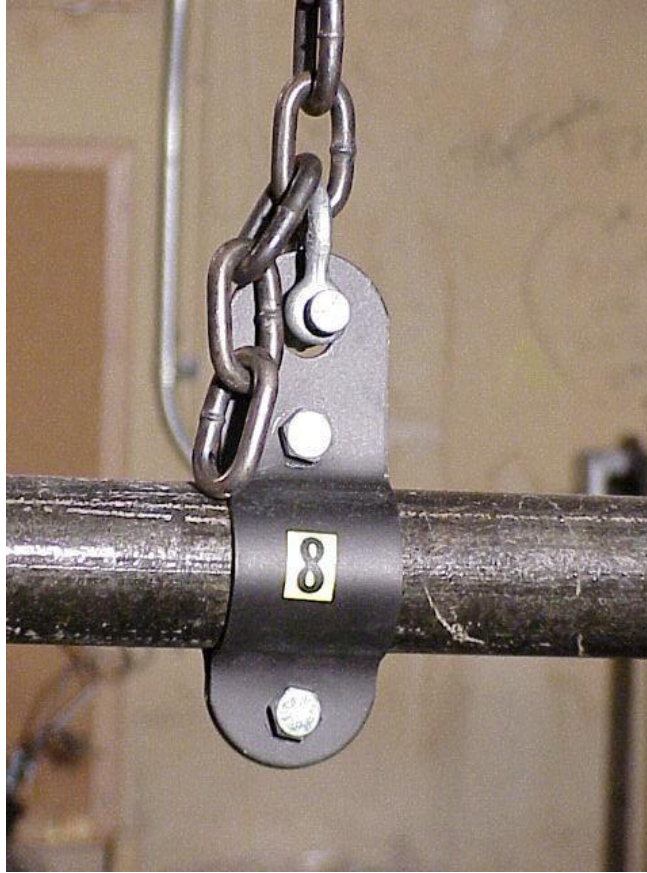
Photo 3 - Showing Trim Chain, Shackle and Batten Clamp

If you use rope or wire rope (preferred) never exceed the Working Load Limit (WLL) of the rope. Do not confuse this value with the tensile or (breaking strength) of the rope. The WLL of a rope is on the order of 1/7^{\text{th}} to 1/10^{\text{th}} of its breaking or tensile strength. This means that if you want to suspend a 20 pound weight, you must use rope with a breaking strength of at least 200 pounds. If you buy rope for doing your rigging you must be able to provide proof of its rating to any member of the safety committee. Otherwise the rope must be removed.